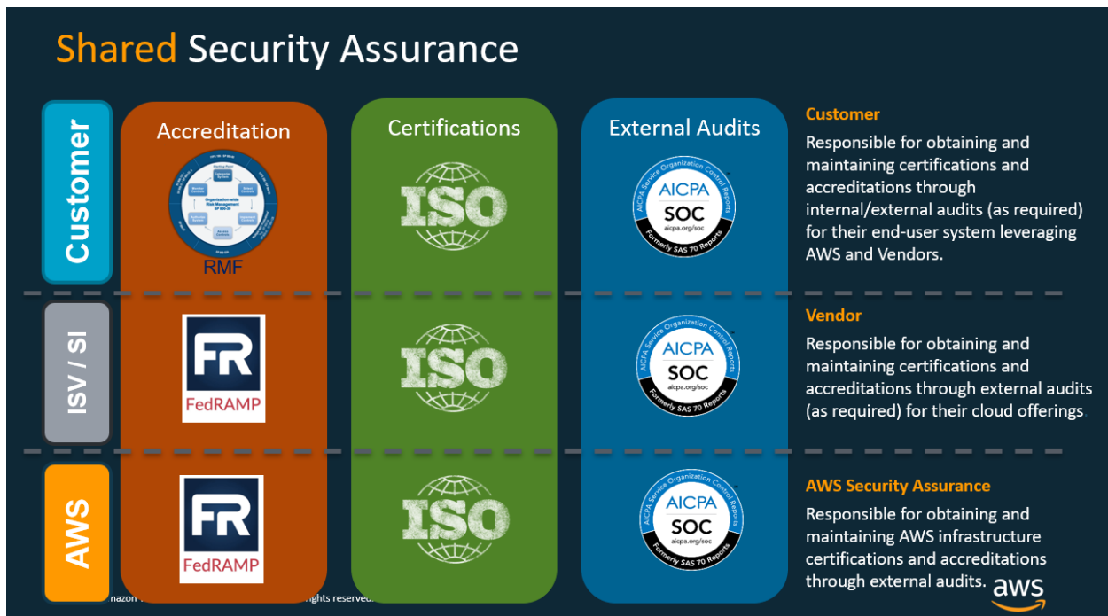
Figure 4 - Shared Security Assurance